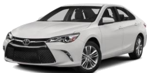
Best Selling Car Camry: 36,991 Units

Nissan has been the second largest Japanese automaker behind Toyota for the third consecutive month. Nissan is now up by 42K sales over Honda which outsold Nissan by 100K units last year. Honda contends the numbers are inflated by fleet sales and long loan terms.