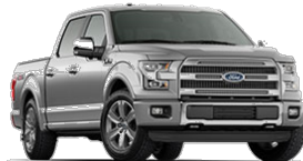
Best Selling Truck F-Series: 55,455 Units