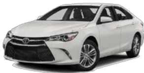
Best Selling Car Camry: 32,405 Units

58% of vehicles sold in February were light trucks (pickups, SUVs, & vans), the 30 th consecutive month that they've outsold cars. Low gas prices are making larger vehicles more appealing but with compact SUVs remaining the best selling retail segment, it's clear efficiency is still on shopper's minds.