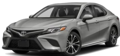
Best-selling car Camry: 43,331 units

With a fresh crop of models, green cars are poised to have a banner year in 2018. Several all-new plug-ins are slated to hit the market early in the year, and perhaps most important the Tesla Model 3, with 400,000 preorders, looks to reach full production at midyear. Not only will green cars grab record market share in 2018, but plug-ins will also outsell traditional hybrids and EV tax credits will begin to expire for vehicles from GM and Tesla, the first in the industry.