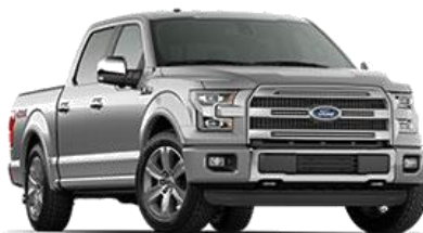
2017 vs. 2016 sales